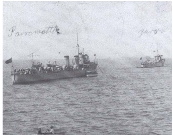
HMA Ships Parramatta and Yarra on a visit to Coffs Harbour 16 May 1911

Gradually the activities of maritime-minded individuals, such as the Director of Naval Forces, Captain (later Vice Admiral Sir) William R Creswell, encouraged political interest in an effective blue-water navy. Finally, on 5 February 1909 a new labor administration, under Prime Minister Andrew Fisher, announced its decision to order three destroyers from British shipyards. The first two (HMA Ships Yarra and Parramatta ), were to be completed and sailed under their own power from Great Britain, and the third vessel (HMAS Warrego ) was to be erected overseas, then disassembled and re-built in Australia.