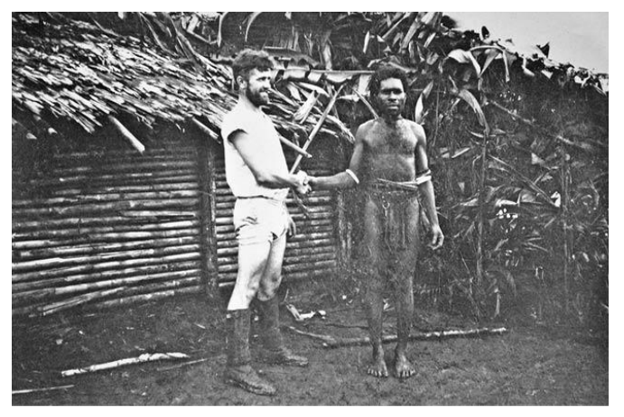
An Adelaide sailor with a locally recruited stores carrier