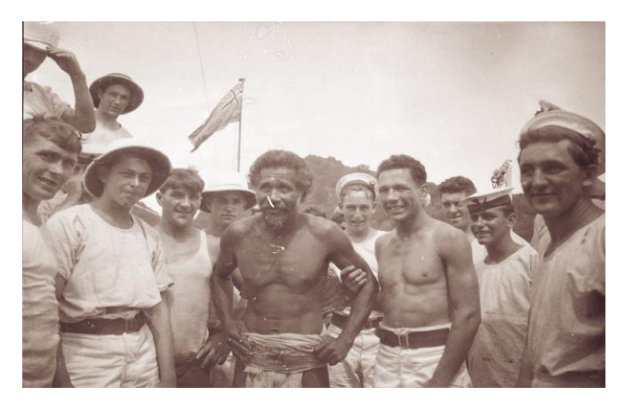
Adelaide sailors with a Solomon Islander

His Majesty's Government of Great Britain desires to convey to His Majesty's Government of the Commonwealth of Australia an expression of their grateful thanks for the help afforded by HMAS Adelaide in the search for the perpetrators of the outrage at Sinarango (sic) and the restoration of order in the disaffected area<sup>4</sup>.