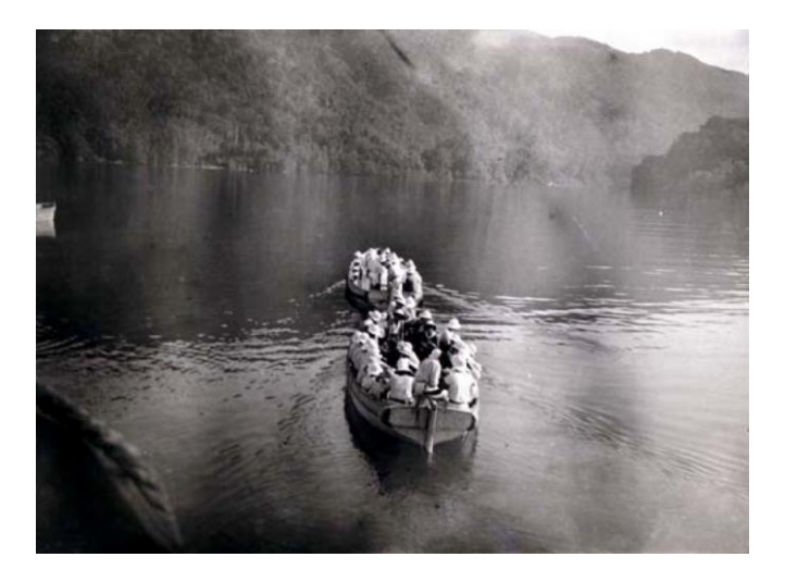
Adelaide personnel landing at Malaita 17 October 1927

proper graves for the deceased local police and burn the deserted village. Gwee'abe became known as Beach Base and by the 18<sup>th</sup> there were over 150 personnel ashore erecting tents, setting up a galley, wireless station, incinerator and field latrines as well as stockpiling stores, equipment, water in kegs and provisions. Onboard Adelaide , 24 hour upper deck sentries were posted in case of an attack from Solomon Islanders in canoes. The reality was that this was an unlikely scenario as those involved in the murders had retreated inland.