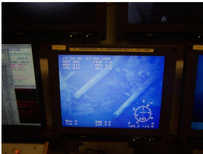
The first glimpse of HMAS Sydney (II) in 66 years was of one of her aft 6-inch gun turrets