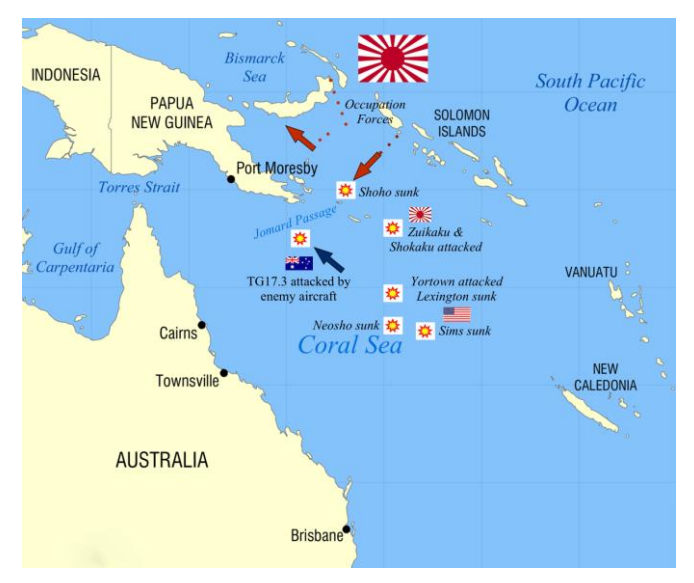
The disposition of the opposing naval forces. Neither fleet was to sight the other during the course of the battle.

seriously damaged and the enemy attacks were successfully beaten off with several aircraft shot down or damaged. Meanwhile Fletcher's aircraft, in search of the main Japanese carrier groups, found and sank the smaller aircraft carrier Shoho covering the invasion convoy while Japanese aircraft discovered and crippled the oiler Neosho and sank the destroyer USS Sims .