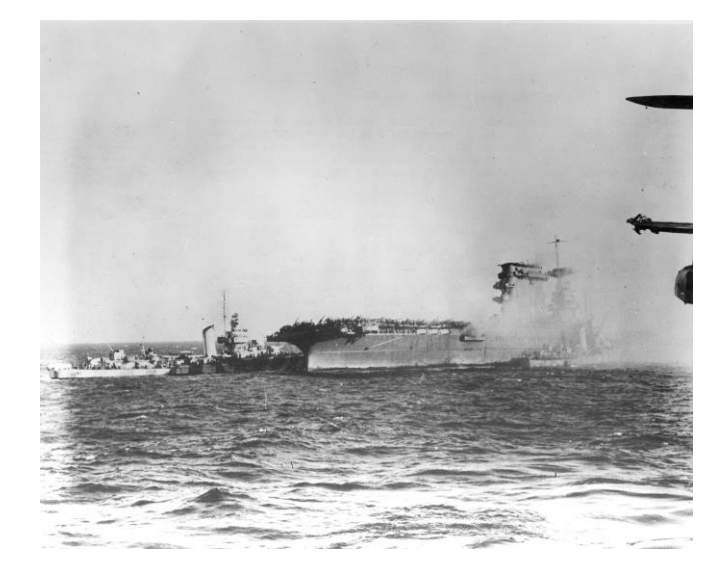
A US destroyer goes to the aid of the crippled Lexington, 8 May 1942.

Damage inflicted on the Japanese included the carrier Shokaku being put out of action and withdrawn to Kure for repairs and Zuikaku , having lost many of her best aircrew and aircraft, being recalled to Japan to resupply. Neither was available to take part in the Battle of Midway in June 1942 which proved a decisive victory for the Americans.