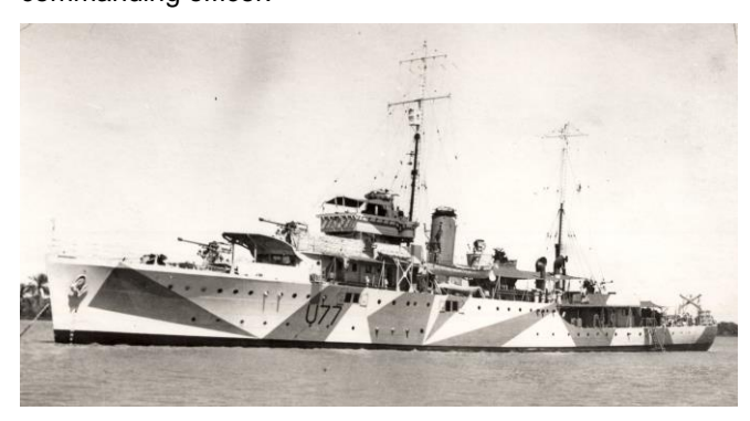
HMAS Yarra wearing her wartime paint scheme

The sloop remained in the Persian Gulf and Arabian Sea area until mid-November when she was dispatched to the Mediterranean to operate on the 'Tobruk Ferry Run' moving troops and supplies into the besieged port of Tobruk and evacuating wounded soldiers. Yarra completed four voyages to Tobruk during 18 November -16 December 1941 and was lucky to escape damage following frequent attacks by German JU87 Stuka dive bombers. Yarra 's sister ship HMAS Parramatta was not as fortunate as she was sunk by a torpedo fired from U-559 on the night of 27 November with only 24 survivors from her crew of 162. One of those lost was Surgeon Lieutenant Charles Harrington, the brother of Yarra 's commanding officer.