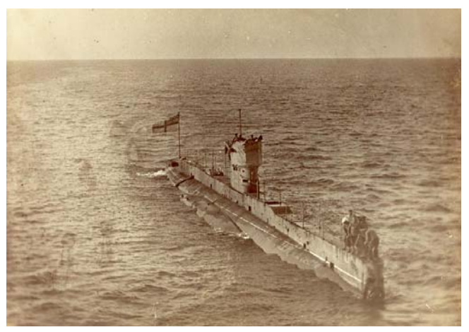
The Australian submarine AE2