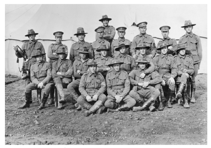
Ratings of the 1<sup>st</sup> RANBT at Domain Camp, Melbourne, 1915, prior to embarking for overseas service

Also at Gallipoli was the 1<sup>st</sup> Royal Australian Naval Bridging Train (1<sup>st</sup> RANBT), formed under the command of Lieutenant Commander LS Bracegirdle, RN, as a mobile naval engineering unit equipped to build pontoons and bridges in support of the military. The initial concept was that it would serve on the battlefields of the Western Front in much the same manner as the engineering elements of the Royal Navy Division. The term 'train', was a direct reference to the horse-drawn wagons that would, in theory, form and move 'in train' to carry the unit's heavy lumber, building supplies and equipment. Many of the ratings serving in the 1<sup>st</sup> RANBT were designated 'drivers' and again this refers to wagon drivers.