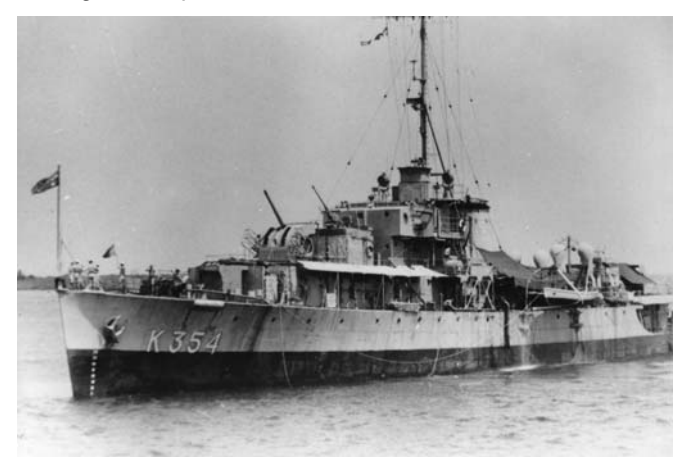
HMAS Gascoyne was one of numerous RAN ships to fight in the Pacific theatre

July 1945 also saw the River class frigate Gascoyne (I) carry out the last naval bombardments in the Balikpapan area. On 26 July, in support of a military force designated BUCKFORCE, Gascoyne proceeded up the Balikpapan River, engaging three separate Japanese held targets as well as landing a military patrol to inspect the village of Mentawir. This action proved to be Gascoyne 's last in the war against Japan.