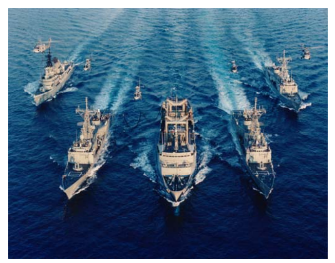
HMA Ships Brisbane, Adelaide, Success, Darwin and Sydney rendezvous for a handover in the Gulf of Oman during Operation DAMASK 1, December 1990.

Not only does 2015 mark the 50<sup>th</sup> anniversary of the Vietnam commitment but also the 25<sup>th</sup> anniversary of the RAN commitment to the Gulf War (1990-91) and the liberation of Kuwait under the auspices of Operation DAMASK 1.