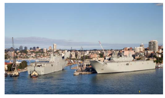
Adelaide (III) passes her sister ship HMAS Canberra (III) on her arrival in Sydney, 26 June 2015.