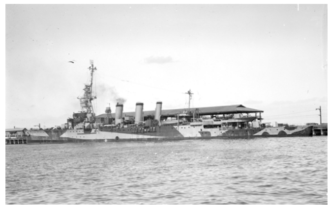
Adelaide (I) wearing her wartime disruptive camouflage paint scheme c.1944.

Several alterations were also made to her armament, including the removal of one 6-inch gun, the 3-inch anti-aircraft gun and the torpedo tubes. Three 4-inch anti-aircraft guns were fitted instead and the gunnery control positions were also modernised.