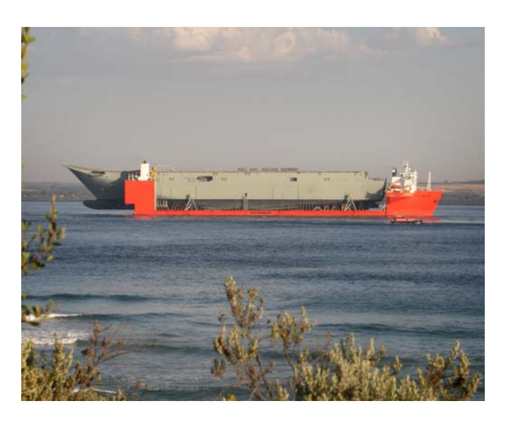
Adelaide (III) enters Port Phillip Bay for the first time on MV Blue Marlin.

After being launched in Spain on 4 July 2012 Adelaide was transported via the heavy lift-ship MV Blue Marlin from Spain to Australia where she arrived at Williamstown Shipyard, Victoria, on 7 February 2014. There work has been ongoing to add the various superstructure and mast components to the hull and complete her internal fit-out. She is currently undergoing acceptance trials.