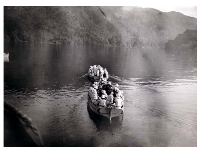
Landing parties from Adelaide (I) proceeding ashore in the Solomon Islands.