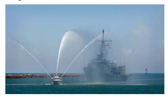
Adelaide (II) is welcomed into her namesake city for the last time in 2007.

Adelaide (II) decommissioned on 19 January 2008 at Fleet Base West. She was subsequently stripped of all useful fittings and cleaned before being sunk as a dive wreck in 32 meters of water 1.8km off Avoca Beach near Terrigal on the Central Coast of New South Wales.