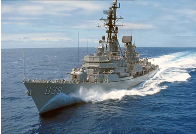
HMAS Hobart (II) underway in the waters off Vietnam

On 29 July 1967 Hobart went to the assistance of USS Forrestal after the aircraft carrier suffered a major fire on board causing numerous casualties, and on 17 June 1968, during the ship's second deployment, two members of Hobart's crew were killed and several others injured when a US Air Force jet mistakenly fired three missiles at the ship. Hobart was awarded a US Navy Unit Commendation for 'exceptionally meritorious service' as an element of the US Seventh Fleet during her first deployment.