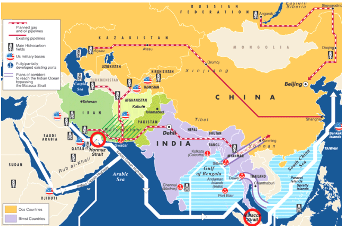
Figure 1: Chinese energy infrastructure in the Indian Ocean 18

The link between China's military and economic interests was made clear in 2005: