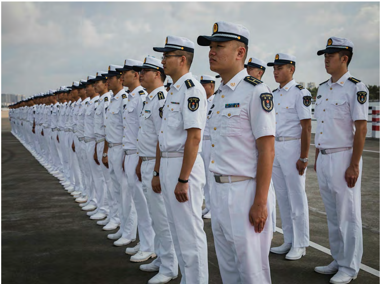
People’s Liberation Army - Navy officers and sailors line the wharf as HMAS Melbourne berths at Zhanjiang Naval Base, China.

During Chinese President Xi Jinping’s visit to Kazakhstan, in September 2013, he delivered a remarkable speech at Nazarbayev University in Astana, the capital city. In a reflective mood, he said, “Shaanxi, my home my province, is right at the starting point of the ancient Silk Road; today, as I stand here and look back at that episode of history, I could almost hear the camel bells echoing in the mountains and see wisps of smoke rising from the desert. A near neighbour is better than a distant relative.” 8 President Xi’s reflection served to frame his main point: that economic success asks states “to combat the ‘three forces’ of terrorism, separatism and extremism as well as drug trafficking and transnational organized crime”. Dealing with these is vital for economic development and for the well-being of the people in the region. 9