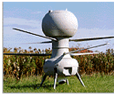
CL327 Guardian TUAV