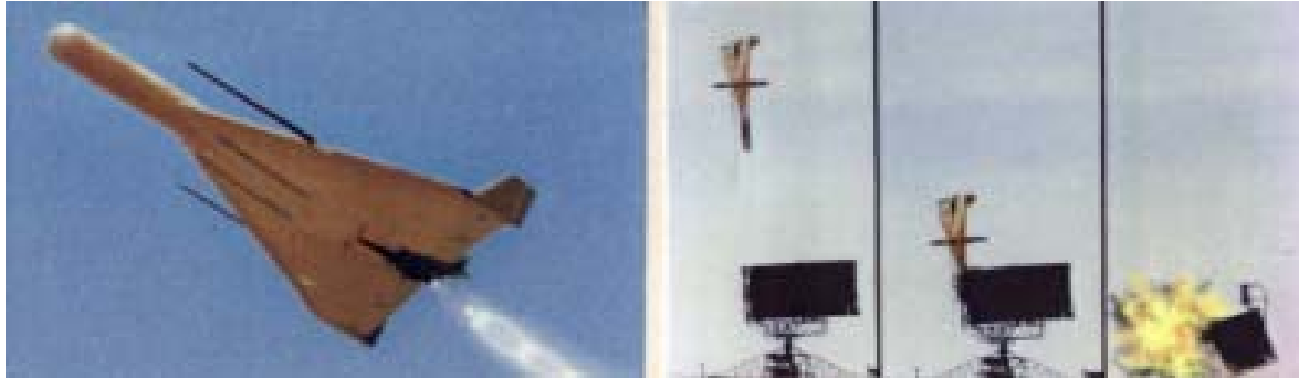
IAI Harpy in flight, and attacking an air defence transmitter

One of the first applications of lethal combat UAVs was the use of Israeli Harpy UAVs in the SEAD role. This UAV was designed to loiter in the vicinity of known air defence sites waiting for emitters to activate, possibly in response to feints by manned aircraft or drones. When the site activates Harpy executes a terminal homing to the transmitter where the high explosive fragmentation warhead explodes. Such a capability is equally applicable against land and sea-based air defence units.