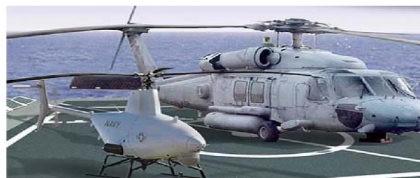
The Model 379 VTUAV in flight, and in comparison to the Sikorsky Seahawk