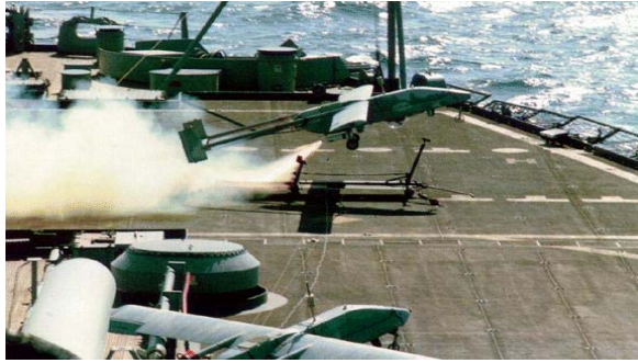
Pioneer RATO launch