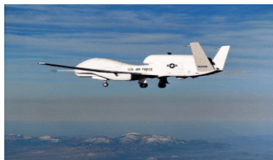
Global Hawk HAE