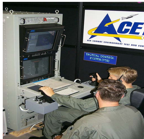
Tactical Control System (TCS) Ground Station

The degree of system integration within ships would depend upon the characteristics of any selected system, the cost and complexity of integration (particularly software), and any guidance from an endorsed UAV concept of operations. Integrated systems would allow UAV tracks to be entered into combat data systems quickly; non-integrated systems could be more readily transferred between fleet units. Any dedicated UAV operating consoles would, ideally, be located in the operations room/s of major surface combatants, space permitting. The location of console/s in smaller classes of ship would depend on the availability of space, power supplies and accessibility to radio transmitters and aerials for air vehicle control. The USN has developed common ground control station architecture for the family of UAVs up to and including Medium Altitude Endurance UAVs such as Predator . The tactical control system (TCS) will provide command and control of UAV air vehicles and payloads, as well as data dissemination to command, control, communications, computers and intelligence systems. Different types of UAVs and payloads can be controlled from the one console. The USN, Royal Navy, and the Canadian Army have acquired TCS for evaluation. 34 It is possible that emerging and next generation UAV systems would require smaller operating consoles, possibly no larger than a laptop computer.