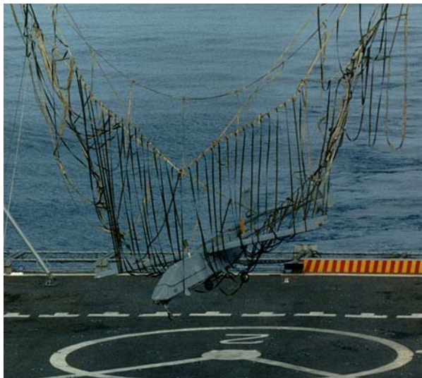
Pioneer UAV net assisted recovery

Recovery of unmanned aircraft is more problematic than their launch. Vertical landing aircraft can be recovered using manual remote piloting to a conventional vertical landing, or by automatic landing systems such as the US UAV common automatic recovery system (UCARS) which has been trialed at sea on board the USS Vandegrift (FFG-48) 35 . Fixed-wing UAVs are presently recovered by more extreme methods, such as by flying the aircraft into a recovery net, by stopping the motor and ditching the aircraft into the water by parachute for a manual recovery, or by mid-air recovery using a manned helicopter or aircraft. The net recovery method was used by the USN for its RQ-2 Pioneer UAV operations from Iowa Class battleships, and from LPD class vessels. The ‘controlled ditching’ method is employed by Kalkara . These fixed-wing recovery methods would probably be impractical for smaller warships operating in other than relatively benign operational and environmental conditions.