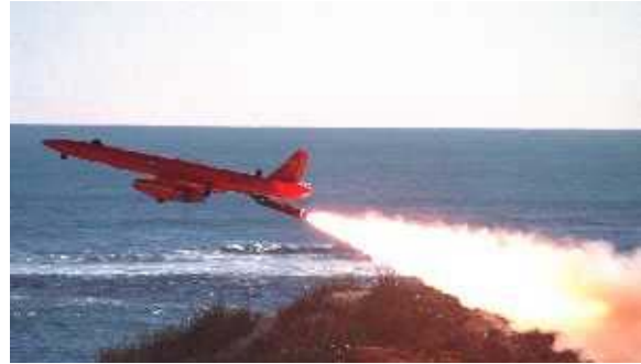
Kalkara RATO launch

Recovery of unmanned aircraft is more problematic than their launch. Vertical landing aircraft can be recovered using manual remote piloting to a conventional vertical landing, or by automatic landing systems such as the US UAV common automatic recovery system (UCARS) which has been trialed at sea on board the USS Vandegrift (FFG-48) 35 . Fixed-wing UAVs are presently recovered by more extreme methods, such as by flying the aircraft into a recovery net, by stopping the motor and ditching the aircraft into the water by parachute for a manual recovery, or by mid-air recovery using a manned helicopter or aircraft. The net recovery method was used by the USN for its RQ-2 Pioneer UAV operations from Iowa Class battleships, and from LPD class vessels. The ‘controlled ditching’ method is employed by Kalkara . These fixed-wing recovery methods would probably be impractical for smaller warships operating in other than relatively benign operational and environmental conditions.