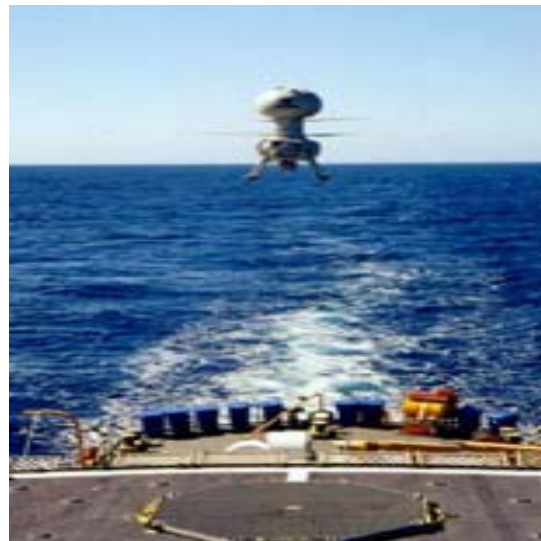
CL327 UCARS recovery