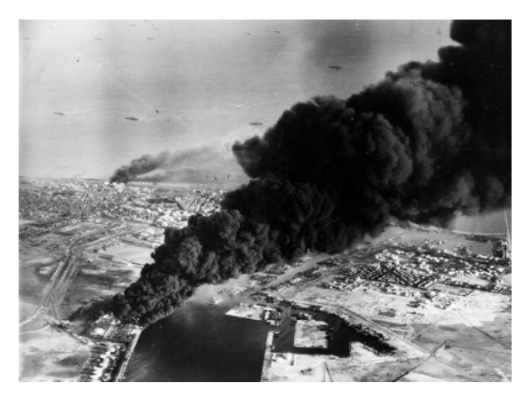
Smoke rises over the Suez Canal following the initial Anglo-French assault during the Suez Crisis.

one of only a handful of supporters, with the UN Security Council demanding the withdrawal of forces and the US threatening to block Britain's access to assistance from the International Monetary Fund so long as it remained in Egypt. Facing a financial crisis, damaged international prestige and protests at home, Britain was forced to withdraw.<sup>6</sup>