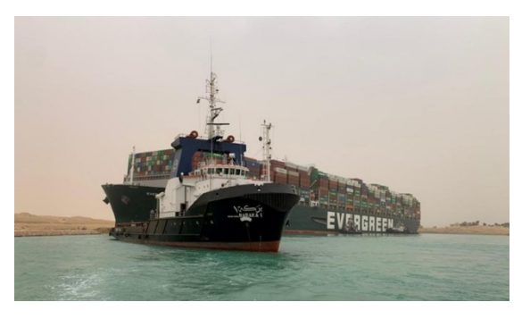
MV Ever Given, one of the largest container ships in the world, run aground in the Suez Canal.

after a week of intensive excavation involving the dredging and removal of 30,000 cubic metres of sand and with the aid of thirteen tugboats.<sup>9</sup>