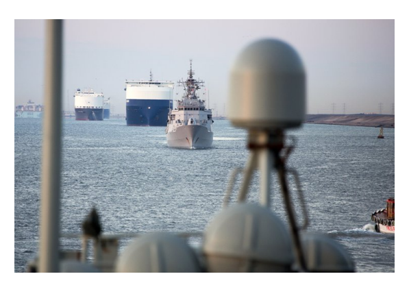
HMAS Anzac transiting the Suez Canal en route to Centenary of Anzac commemorations at Gallipoli.

With this in mind, it is attendant upon the Royal Australian Navy and maritime strategists to continue prioritising secure SLOC, considering how the individual and cooperative actions of navies – such as routing, escort and screening operations – can prevent and alleviate interference to the free movement of shipping.