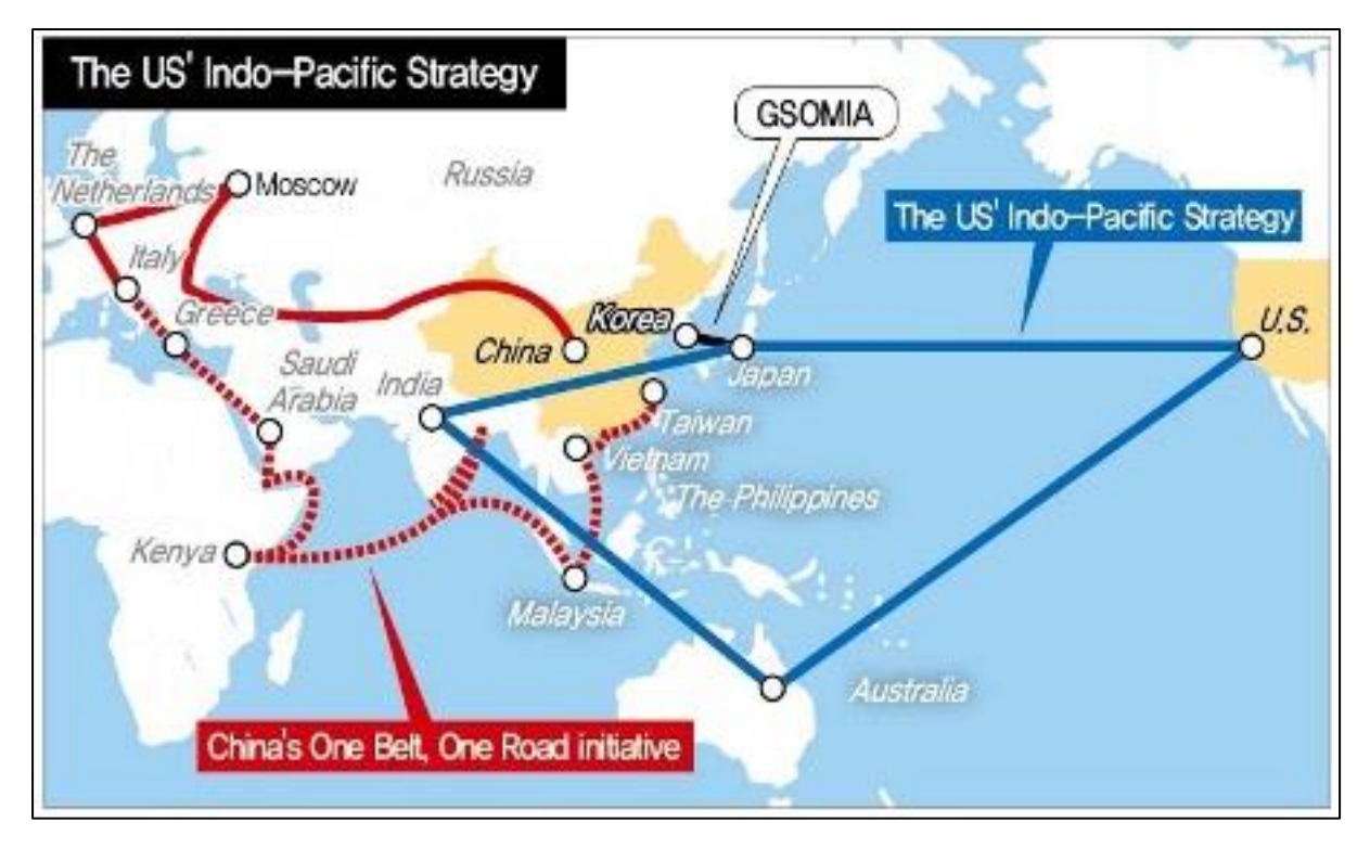
Figure 2: Indo-Pacific Region

Figure 2 demonstrates the geography of the Sino-US 'Strategic Competition' by the overlap of the US Indo-Pacific Strategy (indicated in blue) and the 'One Belt, One road initiative' (indicated in red) through Malaysia, Vietnam and Taiwan. Note also that the four countries linked by the US Indo-Pacific Strategy are part of the Quadrilateral Security Dialogue (or 'Quad' for short). Formed in 2004, it was later abandoned in 2008 following claims (by China) it was an ''Asian NATO'' designed to contain China'<sup>15</sup>. The problem that lies in this region of overlapping and competing foreign policies is how all Indo-Pacific nations are able to build stability and coexist; especially where it is currently defined by 'Strategic Competition' supposedly destined for war. Enter Thucydides.