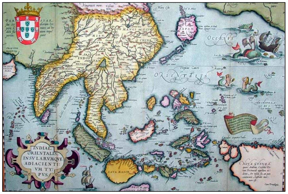
Figure 1: 1571 Indo-Pacific map

contribute to the goal of 'Competitive Coexistence' through military cooperative missions, Humanitarian Aid and Disaster Relief (HADR) priorities, security of natural resources and communication. To understand where Navies should concentrate efforts, the Indo-Pacific must first be defined.